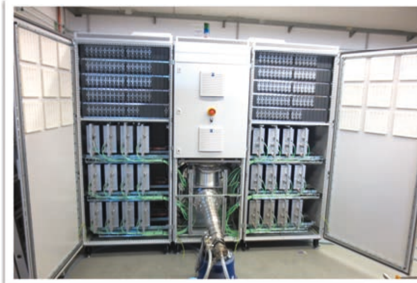
CRE-368B with water cooled RF load attached