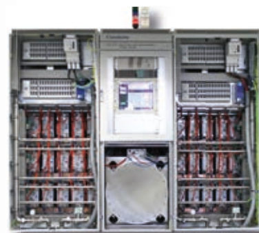
CRE-312C with doors removed